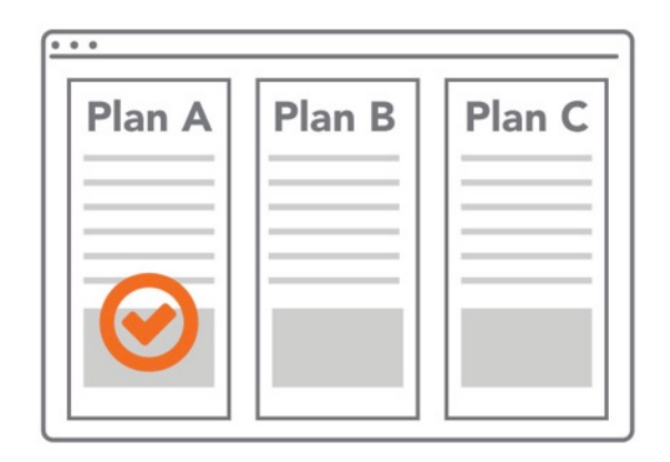
Which plan is right for me?

PlanSource helps consumers make the right choices with personalized plan, coverage and contribution amount recommendations.