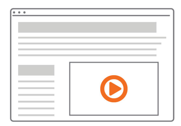
What is an HDHP?

PlanSource helps consumers understand the benefits that are offered to them with personalized educational content.